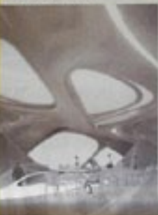
Angewandte, Peter W. Bartsch, 2009

on the Ringstrasse. Final proposals should address the following interconnected questions critical to the creation of a Neue Angewandte: