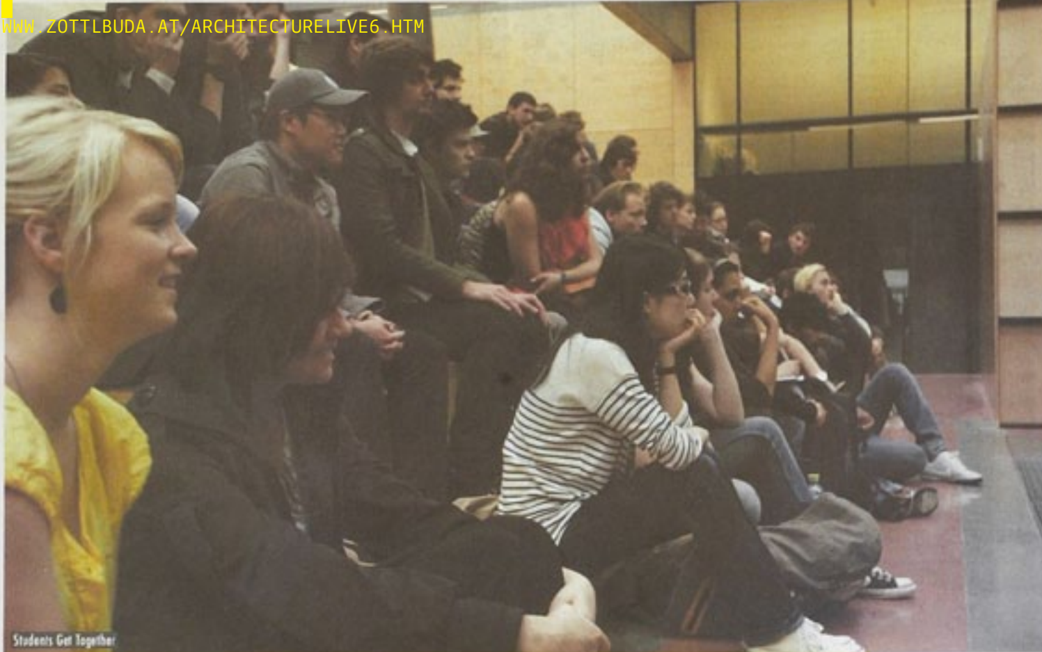
Students Get Together