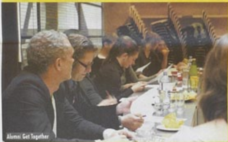
Alumni Get Together